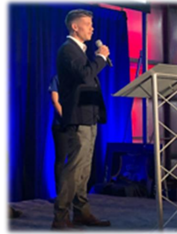
PJTF Gala Speaker