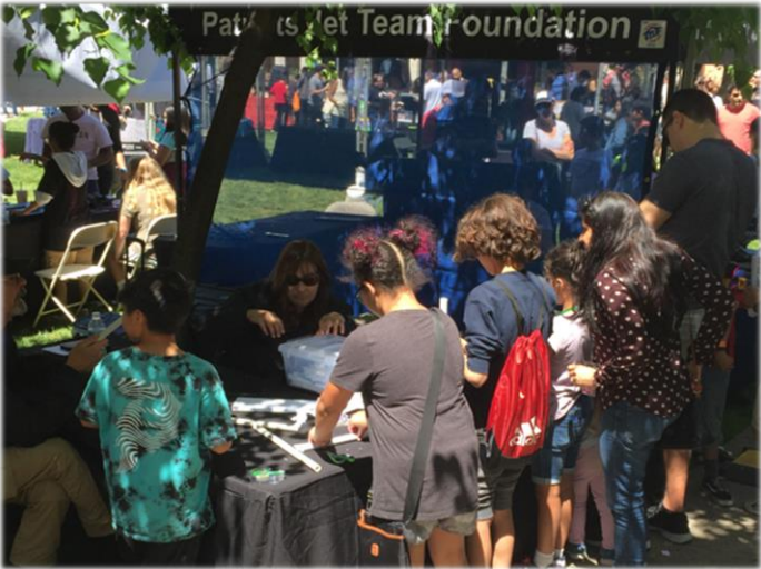
Livermore Innovation Fair