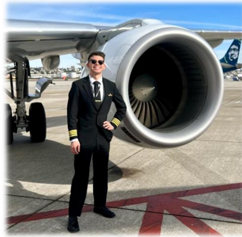
Captain / FO, ERJ175