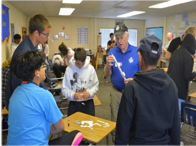
Air Rocket Competitions