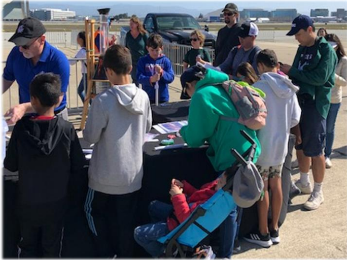
Nasa Ames / GoFly STEM Event