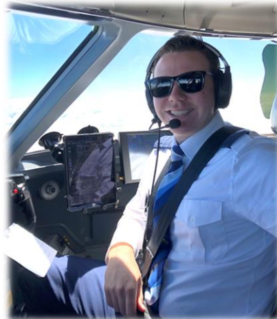
Captain E175 / Q400