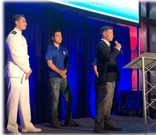
PJTF Gala Speaker