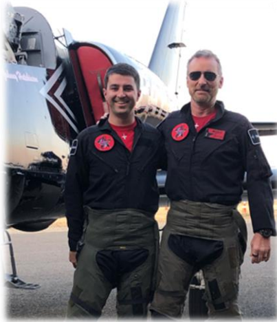
Ferry Pilot, L39