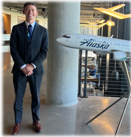
1 st Officer, B37-Max-9