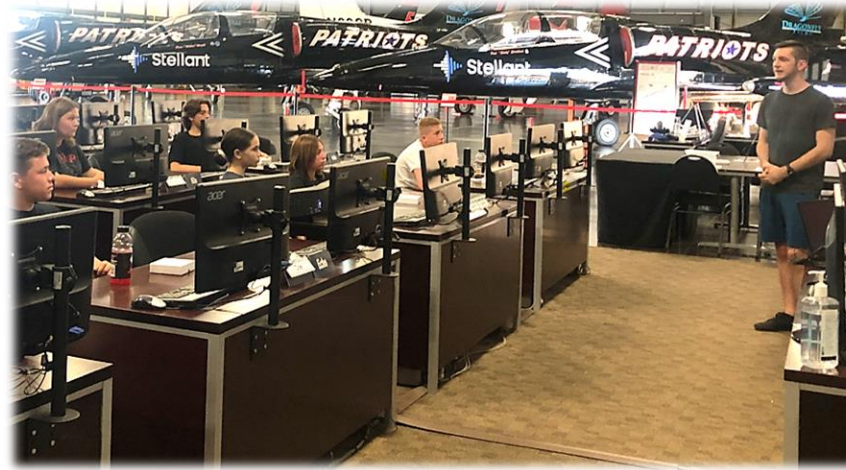
PJTF Guest Speaker