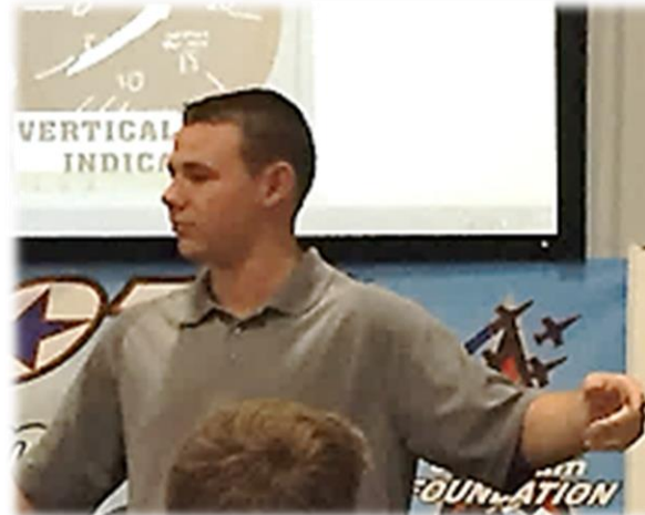
PJTF Aviation Instructor