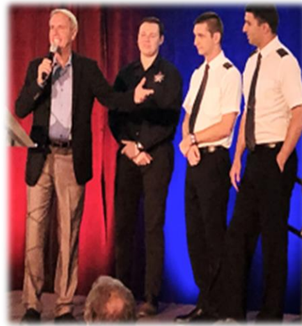
PJTF Gala Speaker