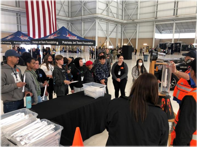
Travis AFB Career / STEM Day