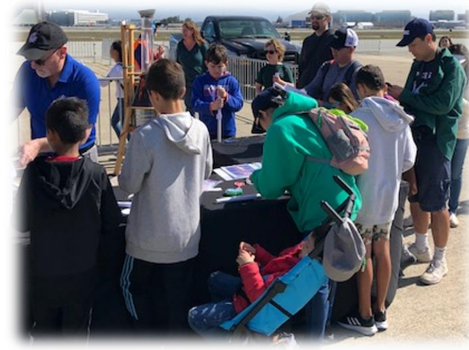
Nasa Ames / GoFly STEM Event