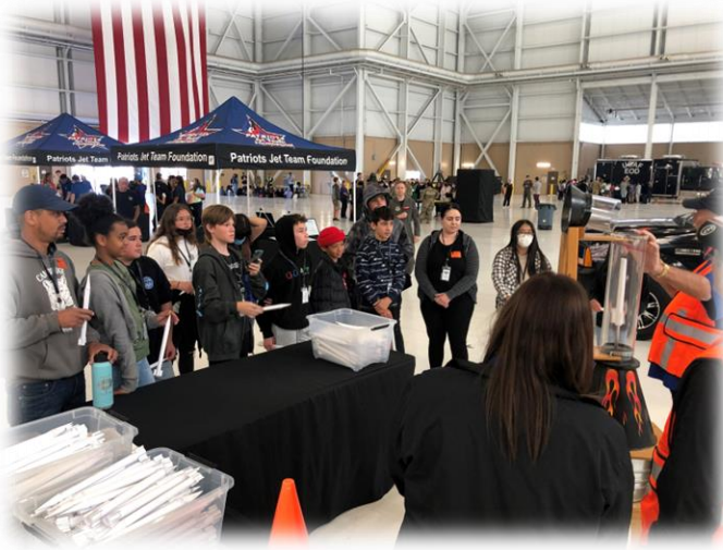
Travis AFB Career / STEM Day