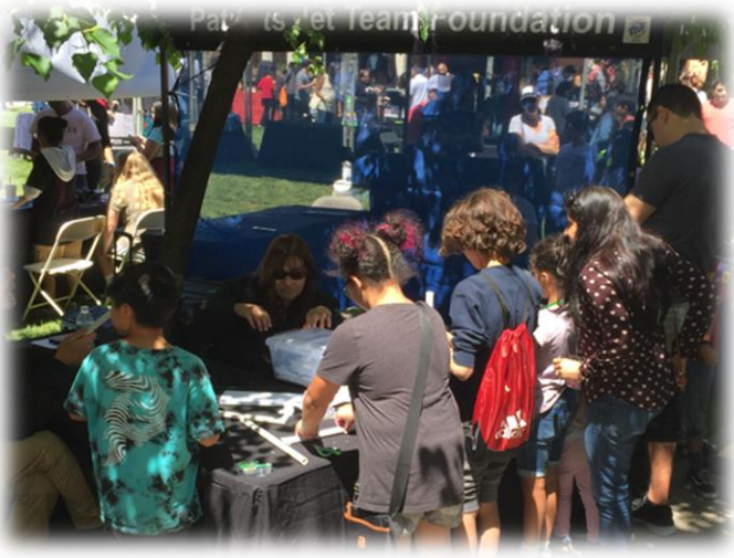
Livermore Innovation Fair