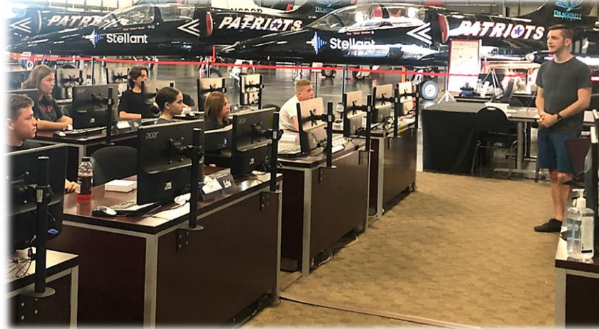
PJTF Guest Speaker