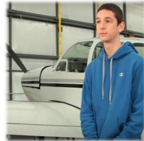
PJTF Student (17YO)