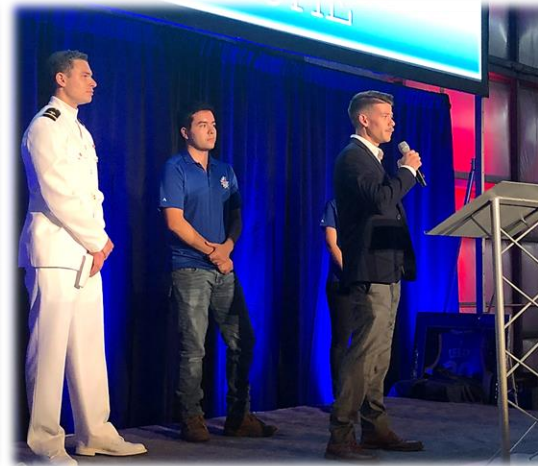
PJTF Gala Speaker