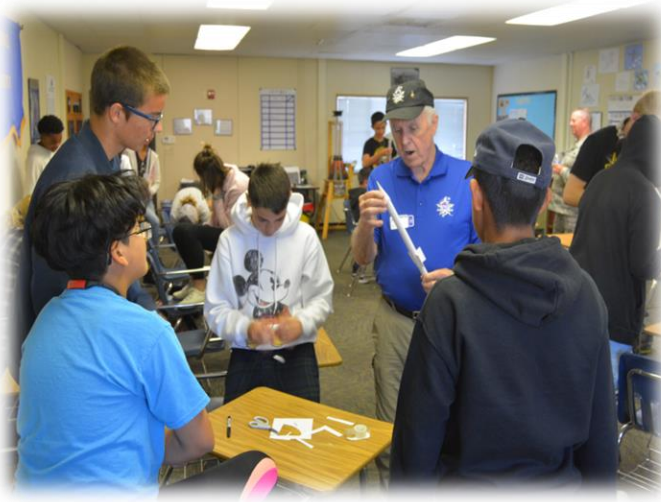
Air Rocket Competitions